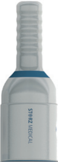
High-energy shock wave